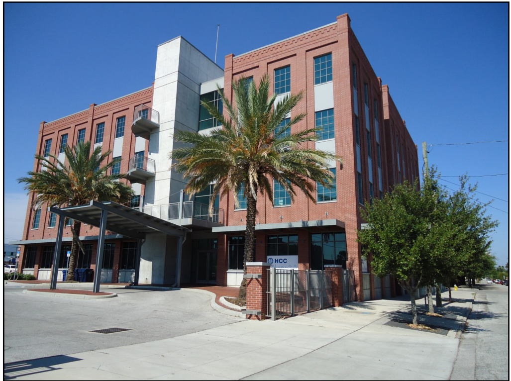
Hillsborough Community College Collaboration Studio

Phone: 813-259-7338 Phone: 813-259-6530 Fax: 813-259-6038 Email: cittinstrutech@hccfl.edu Website: http://citt.hccfl.edu